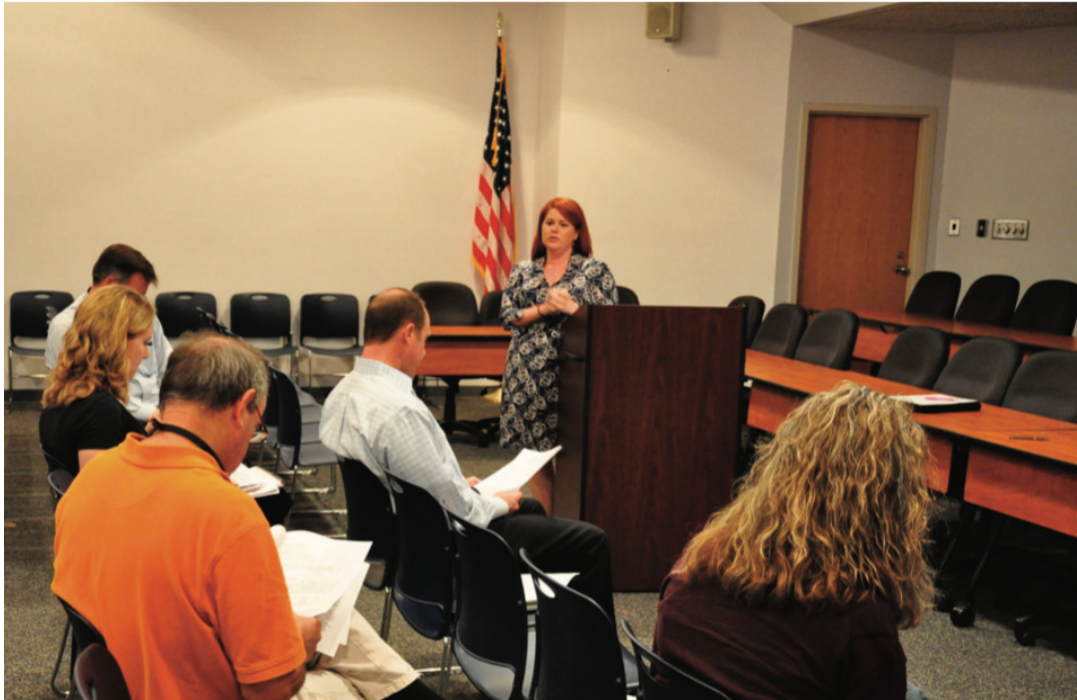
PPI Committee Meeting, March 14, 2016.