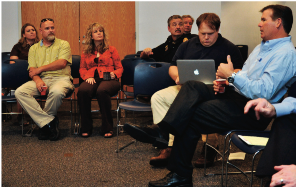
PPI Committee Meeting, October 22, 2015.

The PPI Committee has convened twice to work on the PPI formally, in addition to informal reviews of the PPI through the development phase. The two formal meetings were held on October 22, 2015 and March 14, 2016. The first meeting explained the PPI process and the role of the committee. The second meeting focused on current and future outreach projects and a review of the draft document. In addition, the PPI Committee has reviewed draft PPI documents on an on-going basis.