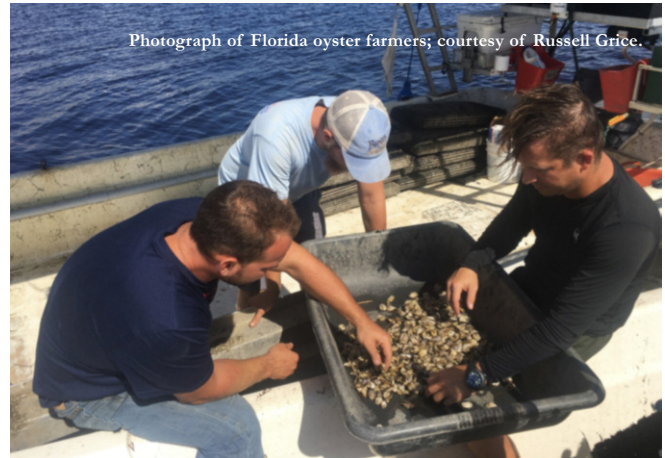
Photograph of Florida oyster farmers; courtesy of Russell Grice.

There are two types of operations for oyster farming: off-bottom and on-bottom. Off-bottom oyster farming is described above. In contrast, on-bottom oyster farming uses racks that sit on the sea floor and are filled with oysters. We have found that this doesn't work as well in the Gulf due to sediment build up and predator loss.