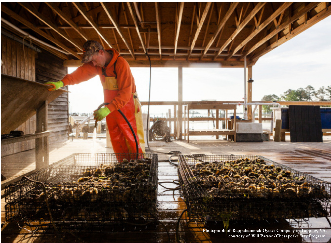
Photograph of Rappahannock Oyster Company in Topping, VA; courtesy of Will Parson/Chesapeake Bay Program.

A comprehensive plan would not be complete without a number of specific goals and strategies tailored to each section of the plan. Within the waterfront section of the comprehensive plan there are 10 broad strategies outlined for waterfront planning. Many of the strategies listed, such as “adopt measurable objectives,” and “dredge responsibly,” have the potential to significantly affect local aquaculture. For example, one objective calls for the city to “support traditional and emerging marine industries.” Additionally, subsets within the objectives direct action that could aid aquaculture, such as one suggestion that the city support the Portland Fish Pier and Fish Exchange as a hub for the seafood economy. By explicitly addressing the needs of local aquaculture within the comprehensive plan, the city is able to develop a road map to inform the city’s interactions with the aquaculture industry.